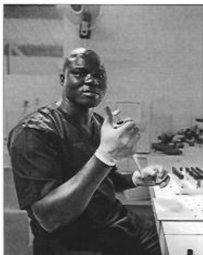
Thank you for supporting the Campaign for a Covid-free world.

As the campaign moved forward, encouraging news hit the headlines. The first deliveries of COVAX vaccines arrived in Ghana and Côte d’Ivoire, with many more countries to follow.